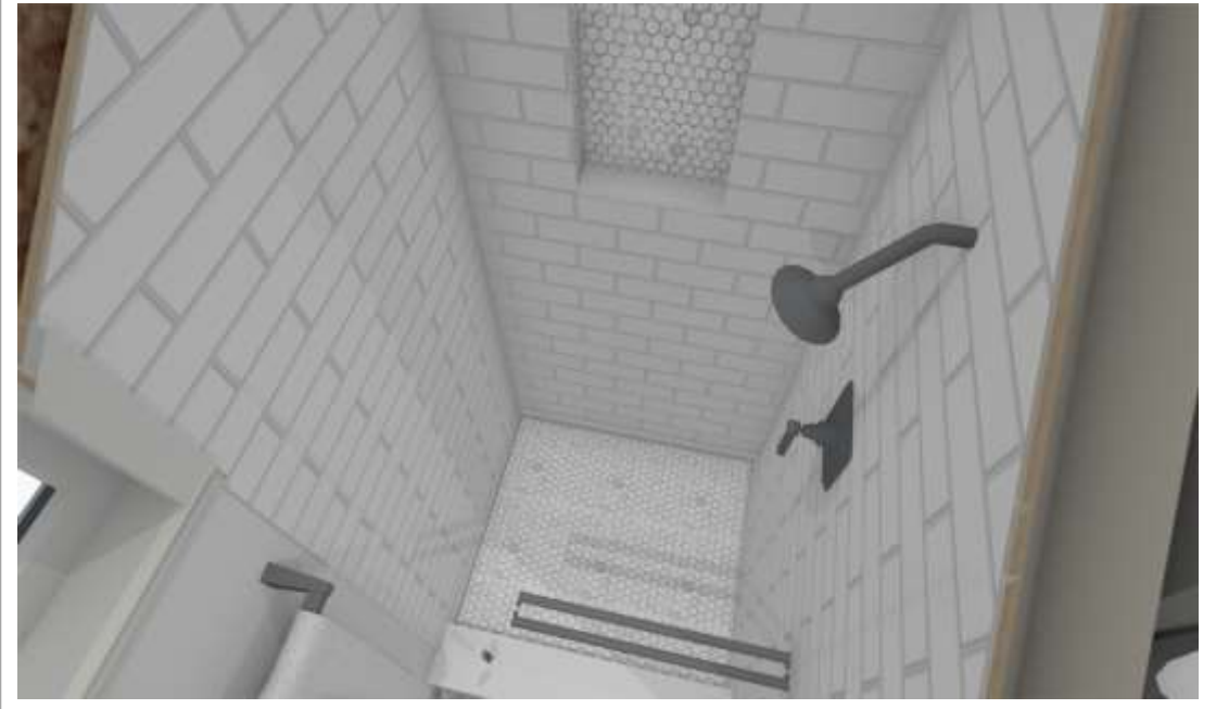
Light gray tile on bathroom floor