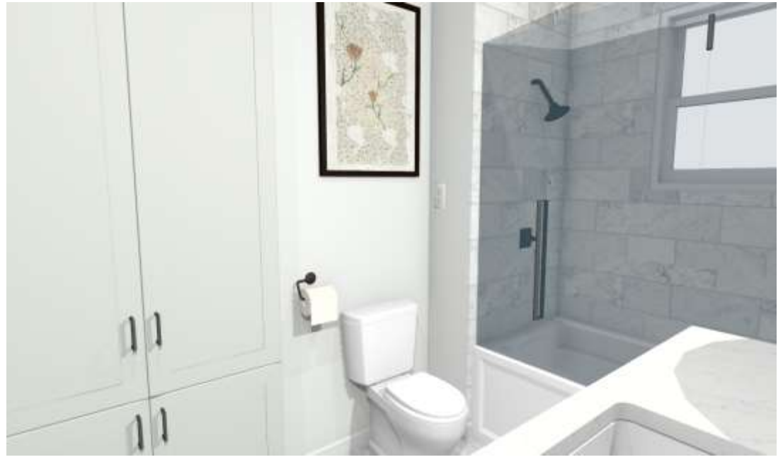
Toilet stays where it is