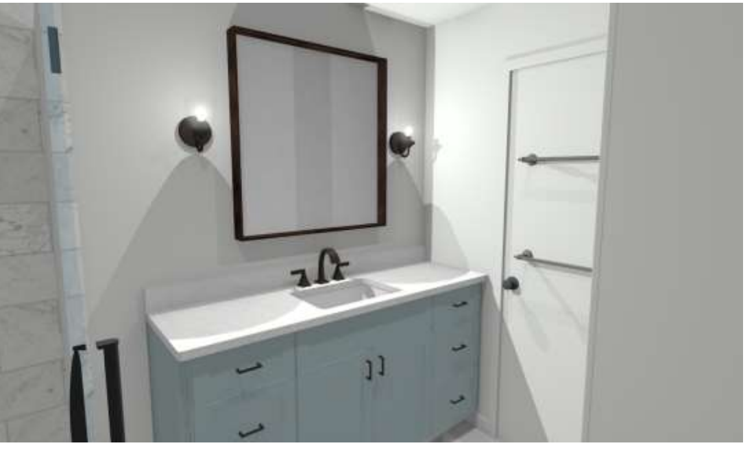
Vanity with squared edges