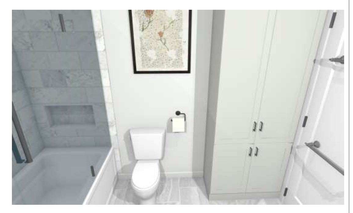
Toilet is moved across room but in SAME bay